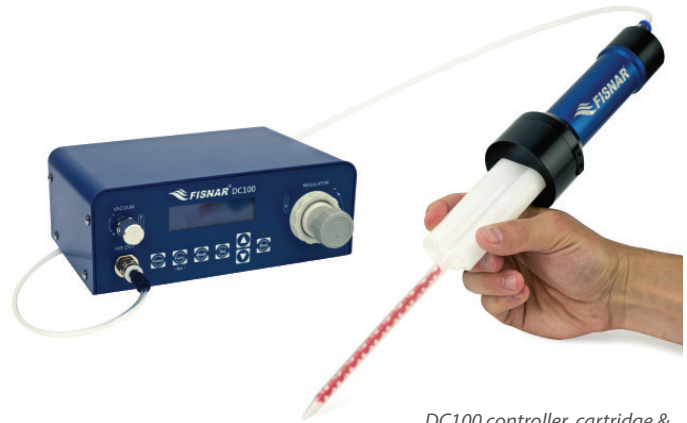
DC100 controller, cartridge & mix nozzle sold separately.

With its simple design and operation, accurate and repeatable fluid deposits are quickly and easily created when connect to a dispense controller.