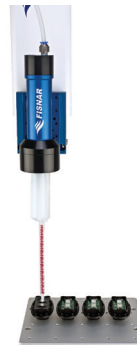
All items shown sold separately.