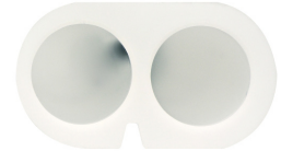
DTD50-RB for use with round back cartridges