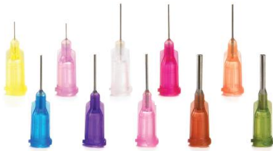
TE Series - Dispensing Tips