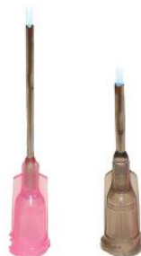
Teflon® Lined - Dispensing Tips

Teflon® lined tips feature a double helix polypropylene color hub and a rigid Teflon® crimped lining that protrudes approximately 1/8" (3.17mm) from the inside of a stainless steel tube. Sold in packs of 50.