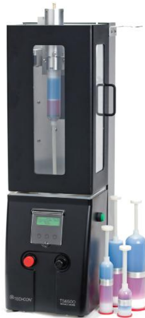
TS6500 - Cartridge Mixer